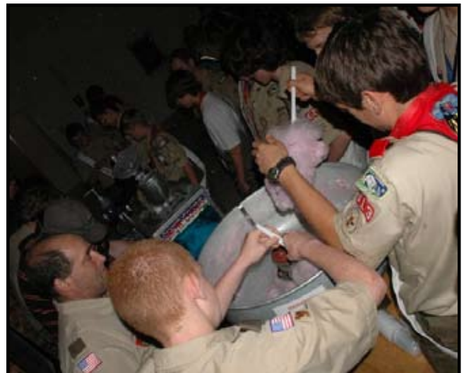
SCOUTS AND SCOUTERS SERVE UP SWEET, SWEET BROTHERHOOD AT THE 2011 SECTION NE-1A CONCLAVE IN JUNE

The Totem is published quarterly. If you have an article or photograph for submission, please send it to The Totem , Order of the Arrow, Daniel Webster Council, 571 Holt Avenue, Manchester, NH 03109 or e-mail it to totem220@gmail.com . Next submission deadline: Sept. 18, 2011.